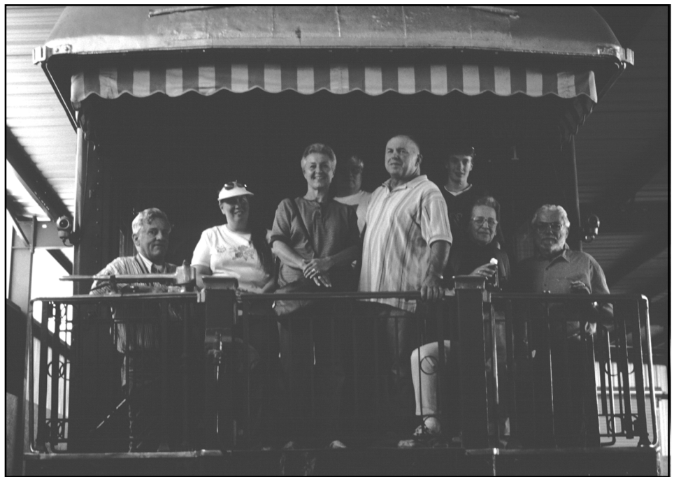
Club members on the observation platform of the Great Western Railway business car YELLOWSTONE during the club shops tour on August 8th.