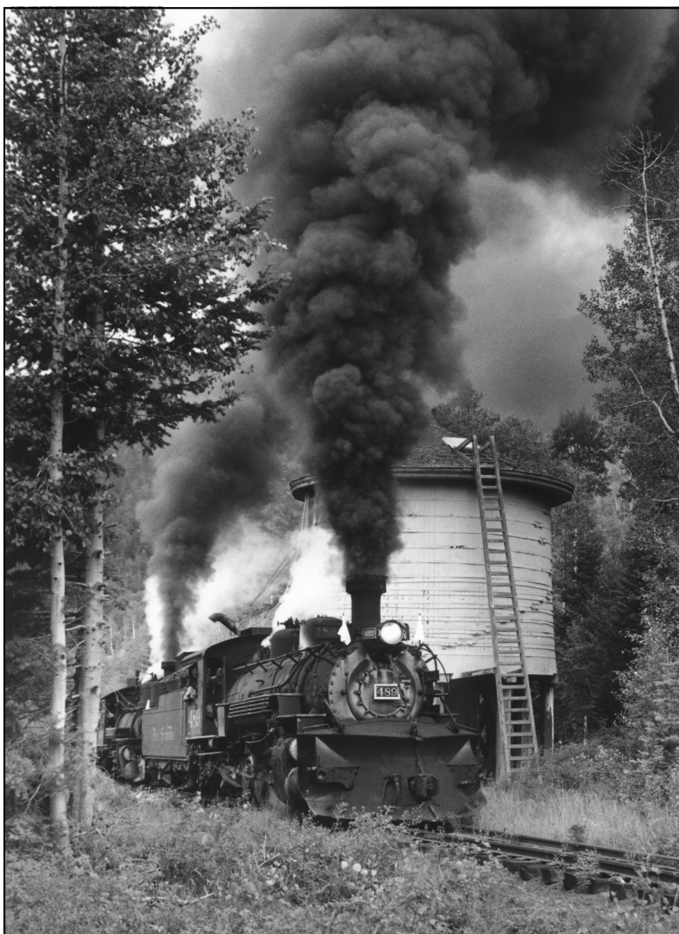
Engines #489 and #463 at Cresco tank on July 25, 1998.

Throughout the weekend the scene of railfans capturing the historic locomotives on film was repeated many times over. Stops at Coxo, Windy Point, Cumbres Pass and Cascade Creek Trestle occurred prior to the train stopping in Osier to allow for the regular tourist passenger train from Antonito to pass. Passengers had a short layover in Osier to stretch their legs and to